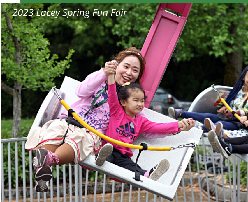
2023 Lacey Spring Fun Fair

Typical attendance is between 16,000 - 20,000 people of all ages. For full packages, please confirm by Feb. 10.