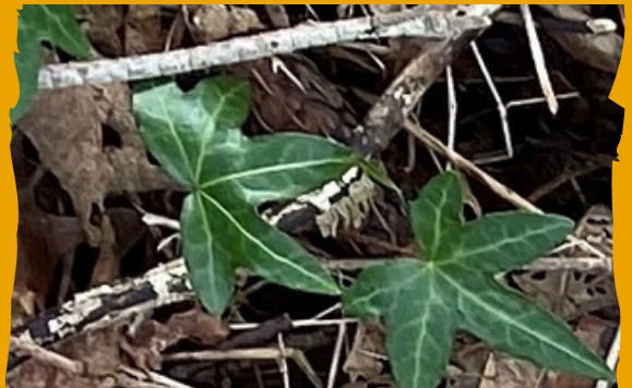
Juvenile English Ivy