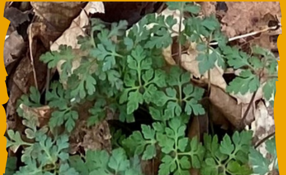
Geranium Robertianum (Stinky Bob)