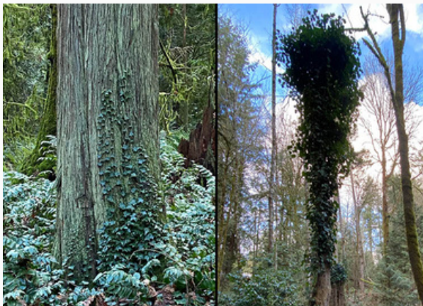
Wonderwood Park Left: Ivy beginning to climb a tree trunk. Right: Overgrown ivy on a tree.