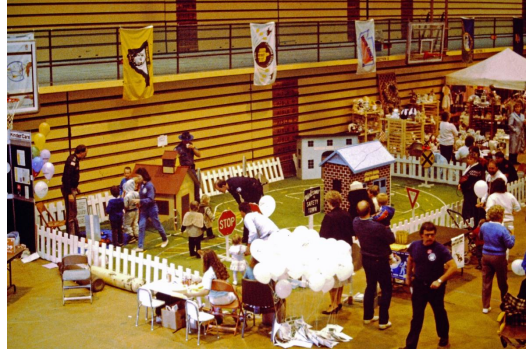
Safety Town inside the Marcus Pavilion at Saint Martin's University in the late 1980s/early 1990s. Photo undated.

Our 38th Annual Lacey Spring Fun Fair takes place 10 am - 6 pm on May 17 and 11am - 5 pm on May 18 at Saint Martin's University! Join in on the fun!